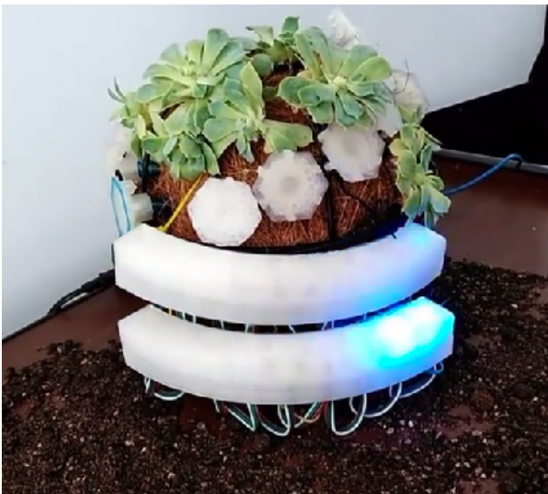
Figure 2. Prototype 2