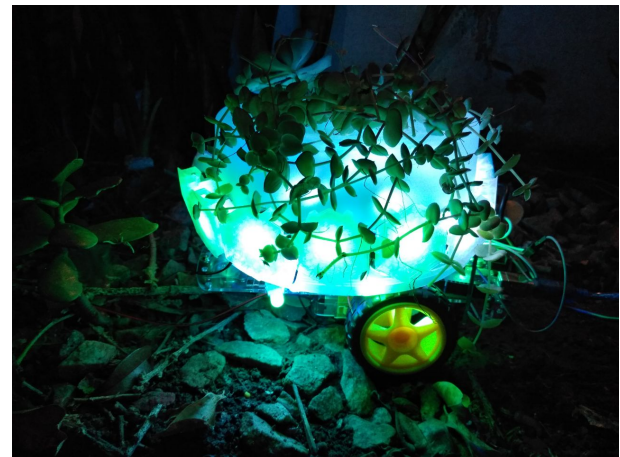
Figure 1. Prototype 1

When a living being is linked to the robotic entity, a direct analogy is established with the community and the concept of sustaining life. It is in this sense that the self-sustaining factor is established, where an