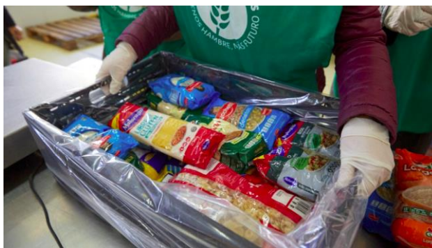
Figure 3 - One of the donations received by the Bank

Therefore, it has been proposed to create software tools based on machine learning to assist in the task of classifying and registering products.