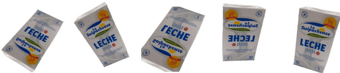
Figure 5: Images of milk after applying data augmentation.

The data augmentation process was performed using Keras' image generator, named ImageData Generator. It was configured to normalize the values, and to generate in addition to the original image, other images transformed by zoom, horizontal and vertical flip rotations, cut transformations, etc. Figure 5 shows some of the generated images.