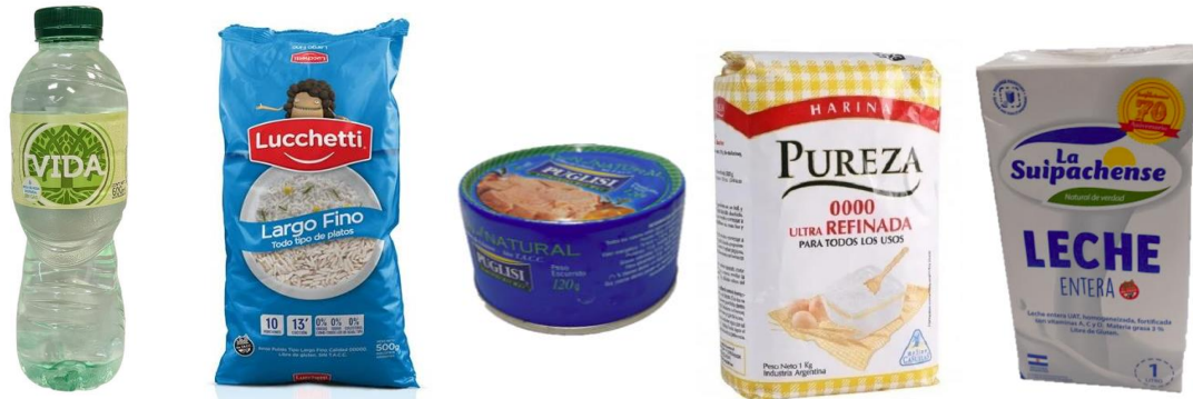
Figure 4. Dataset images for each of the categories