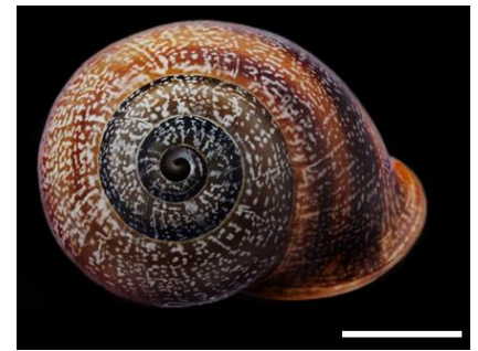
Fig. 1. Otala punctata from Bahrija, Malta. Scale bar 10 mm.

A second population of Otala punctata (Fig. 1) subsequently established itself at Bahrija, a rural agricultural area, some 7 km distant from the original site of introduction. The authors investigated the distribution and abundance of Otala punctata at the Bahrija site, as well as that of the native helicid Eobania vermiculata (Müller, 1774), which has a similar ecology to that of the alien species under study and which, therefore, may be negatively affected by the introduction.