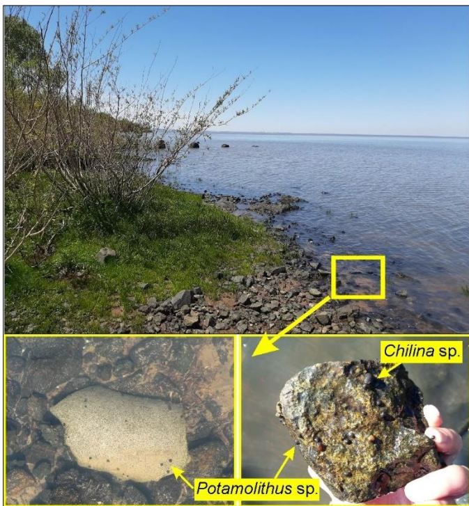
Fig. 1. Martín García Island, Buenos Aires province, Argentina. Potamolithus sp. and Chilina sp. in yellow box.

Limnoperna fortunei (Dunker, 1857) (Pastorino et al. , 1993) was recorded in the Río de la Plata. This species is considered an ecosystem engineer for its ability to transform the environment it colonises (Darrigran & Damborenea, 2011). The presence and abundance of the golden mussel have led to a decrease of native gastropods, displacing local populations of Chilina fluminea (Maton, 1809) and Uncancylus concentricus (d'Orbigny, 1835) on the Argentinean coasts of the Río de la Plata (Darrigran et al. , 1998).