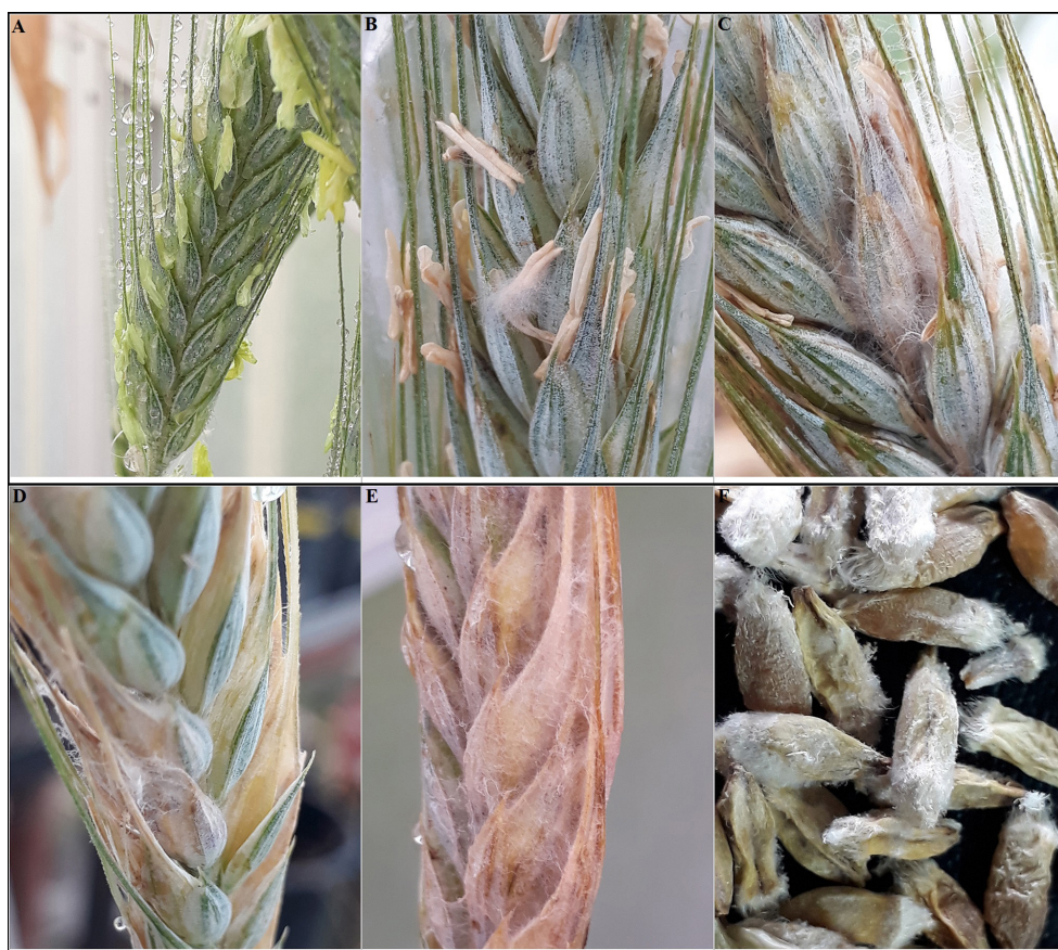
Figure 2. Fusarium head blight (FHB) progress in spikes inoculated with F. graminearum s.s. isolates collected on triticale. (A) Inoculation of the spike at anthesis. Disease progress at: 2 dpi (B), 7 dpi (C), 14 dpi (D), and 21 dpi (E). (F) grains at physiological maturity.

Based on morphological characteristics, the isolates obtained from triticale were identified as F. graminearum (Schw.). The presence of sporodochia formed by macroconidia with 5-6 septa with a width average value of 4.5\text{--}5\text{ }\mu\text{m} and a length average value of 50\text{--}60\text{ }\mu\text{m} was visualized. Moreover, abundant chlamydospore presence were visualized, which are frequently found in the macroconidia, while microconidia were not found (Leslie & Summerell, 2006). The results of F. graminearum specific PCR amplified a fragment of 400-500 pb as expected according to Nicholson et al. (1998). To confirm molecularly our results, the final sequences of red and tri101 fragments of T1 and T2 isolates were compared by