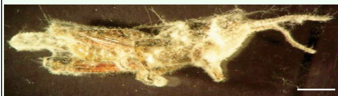
Figure 3. Fusarium verticillioides on third-instar nymphs of Ronderosia bergi 48 h after death. Scale bar: 14 mm. High quality figures are available online.

The means by which the infection of T. collaris and R. bergi by F. verticillioides might have been effected is not clear, but Kilpatrick (1961) stated that the entry of the fungus into the insect could occur via the oral route, oviposition tubes or wounds.