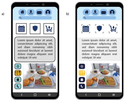
Fig. 3. The principle of Simplicity applied to reach a minimalist design.

The heuristics "Aesthetic and minimalistic design" points out that the design of an application should be minimalist, although not necessarily applied as a style, but rather as a guideline to reduce the amount of visual information provided to the user. In this sense, the Gestalt principle of Simplicity refers to how human beings perceive the forms even if they only appreciate a portion of them. These concepts allow the development team to narrow down the aesthetics-oriented graphics and orient it towards clarifying interface functions. Figure 3 shows how the graphic details of the interface are reduced, without changing the functions.