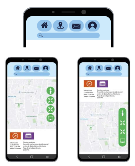
Fig. 2. The principle of proximity applied to the menus of a mobile application.

The Heuristic called "Recognition rather than recall", in an interface refers to the fact that essential actions must be identified in the foreground so that the user learns to perform them intuitively; The basic actions of the application should be grouped in such a way that categories and hierarchies are established naturally; for this, the elements must remain visible at all times, until the user becomes familiar with the application. In figure 2 you can see that the graphic similarity of the icons and their proximity generates that user perceives different menus and interface configurations.