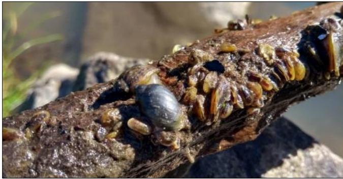
Fig. 2. Chilina fluminea (Gastropoda, Chiliniidae, length ~ 1.5 cm) in the Río de la Plata (Buenos Aires province), on a branch with settled Limnoperna fortunei (Bivalvia), an invasive species and one of the main threats to the epifauna in this river basin.

conservation status. In addition, we aim to analyse how the distribution of freshwater molluscs is related to protected areas. In this sense, the work of Torres et al. (2018), which showed that fewer than 14% of the Argentinean protected areas have records of Unionida and only 9% have records of four or more species, may serve as a useful precedent.