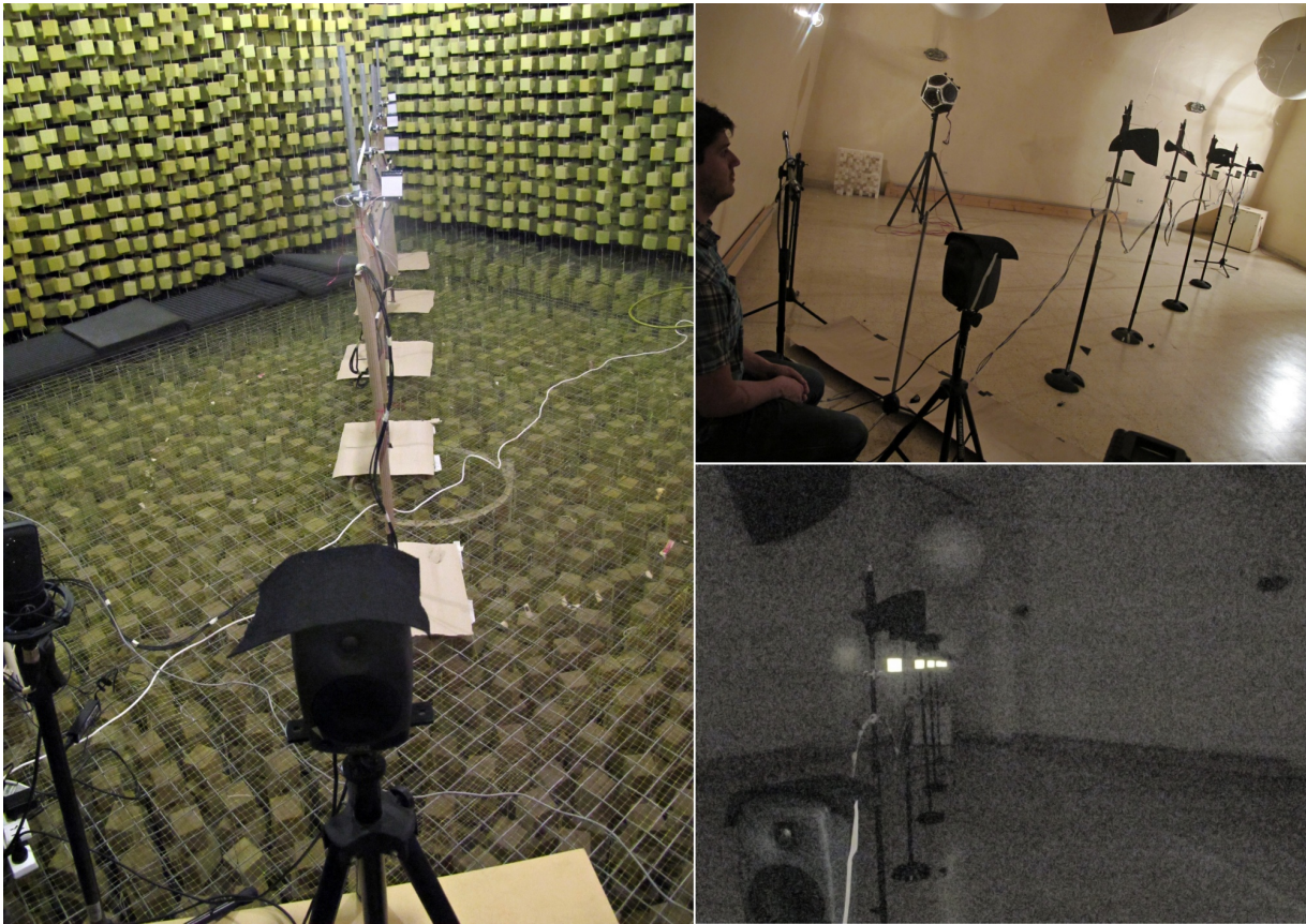
Figure 1: Details of the experimental setup. (a) View from above the subject in the anechoic room. (b) Lateral view in the reverberant room. The subject can be seen on the left. (c) View from the subject position in the reverberant room. The room is in darkness and all targets are lit. The shot was taken with a little displacement to the right, in order to avoid occlusion by the nearest targets.

chamber, although both rooms are of similar sizes. Finally, we note that by separating participants between musicians and non-musicians only the former group perceived differences in the size of the room through auditory modality; moreover, only this group perceived the distance to the visual object in the reverberant chamber farther than in the anechoic chamber. These results suggest that the auditory environment can influence the VDP through reverberation related cues.