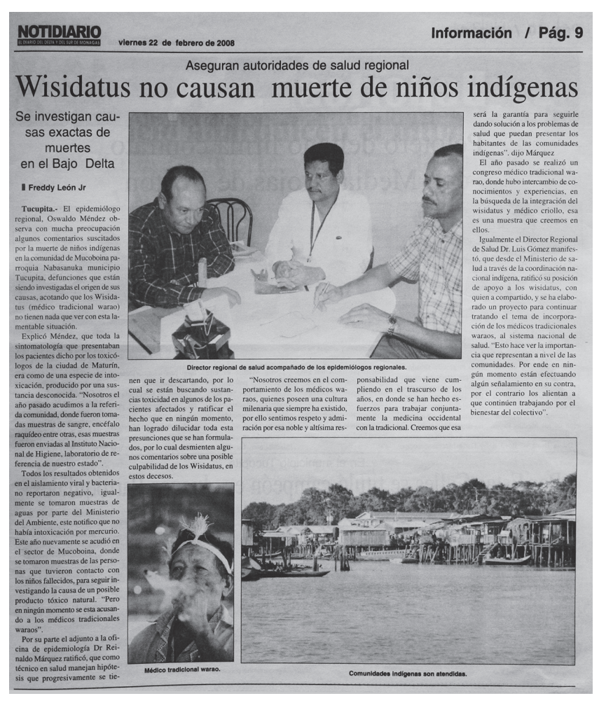
Figure 3. Newspaper article regarding the epidemic. Delta Amacuro, Venezuela; 2008.

Note: The title reads "Regional health authorities affirm that Wisidatus [traditional Warao healers] are not causing the death of indigenous children."