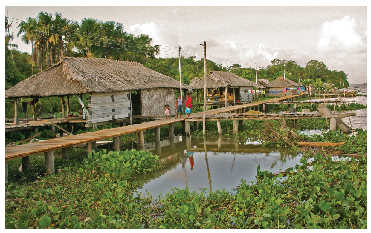
Figure 1. Mukoboina Village, Delta Amacuro, Venezuela; 2007.

other residents. The parents' testimonios [testimonies] – along with clinical examination of one patient – permitted Clara to provide a presumptive diagnosis of rabies; most patients had been bitten nocturnally by vampire bats one to two months before developing symptoms, indicating a likely route of transmission.