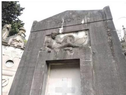
FIG. 1. Mausoleum of Yalour.

The Yalour mausoleum is located in the Cemetery of La Plata, Buenos Aires, and Argentina. It is a monument of 3.25 m front made of reinforced concrete and it presents in the front a sculpture of a marine scene FIG. 1. Samples were taken at 4 sites on the walls by scraping with sterile scalpel and from the glasses of the mausoleum. In the laboratory, portions of each sample were separated for observation and taxonomic determination of the algae under the optical microscope (Arcano), in the scanning electron microscope (FEI, Quanta 200) and in the epifluorescence microscope (Olympus BX51). The rest of the samples are kept in culture broth BG11.