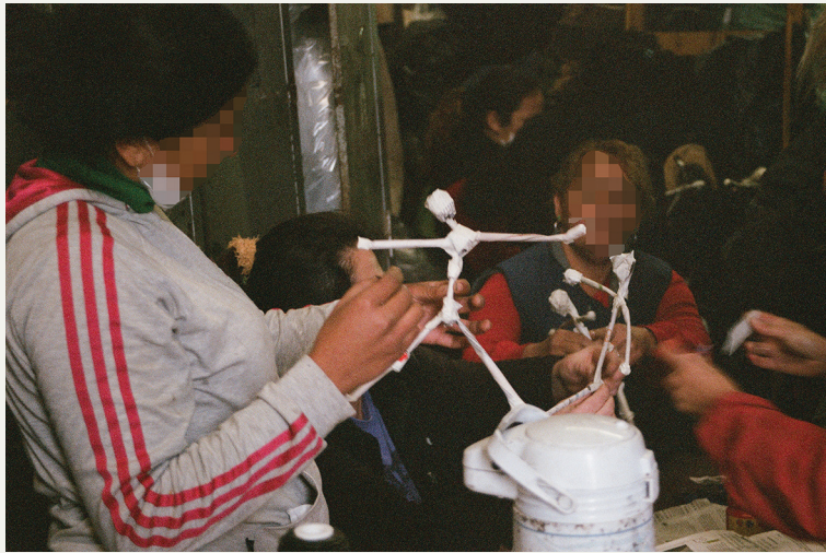
Figure 1. Workers at the waste sorting and classification peri-urban center indicating the points of tension and pleasure to determine the demands of the standing position in the job. Buenos Aires Metropolitan Area, Argentina, 2015.