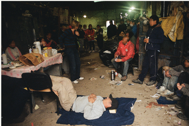
Figure 2. Workers at the waste sorting and classification peri-urban center doing eutony exercises. Buenos Aires Metropolitan Area, Argentina, 2015.